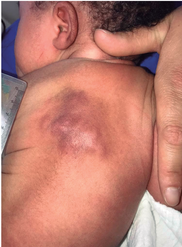
Figure 1. New born with confluent nodular lesions, erythematous in posterior trunk.